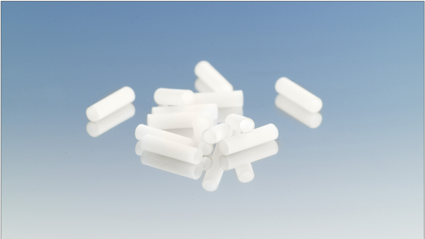
Balloons cut to length – ready to use.

Nolato offers catheter balloons cut to length which yields high quality cuts as a competitive option.