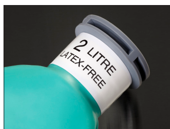
Soft TPE connector