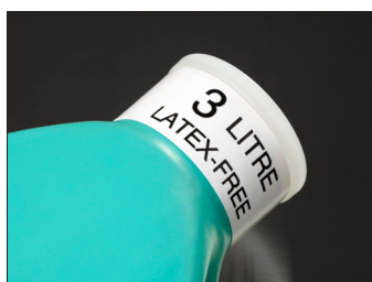
Rigid PP connector