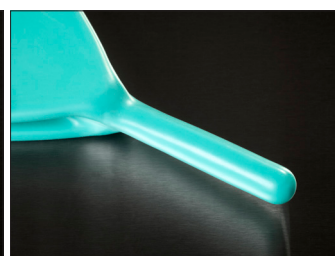
Extended tail 1/2 L bags

For more information, RFQ, orders etc. please contact: