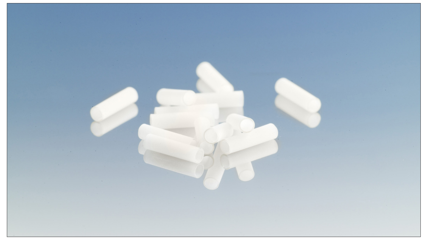
Balloons cut to length - ready to use.

Nolato offers catheter balloons cut to length which yields high quality cuts as a competitive option.